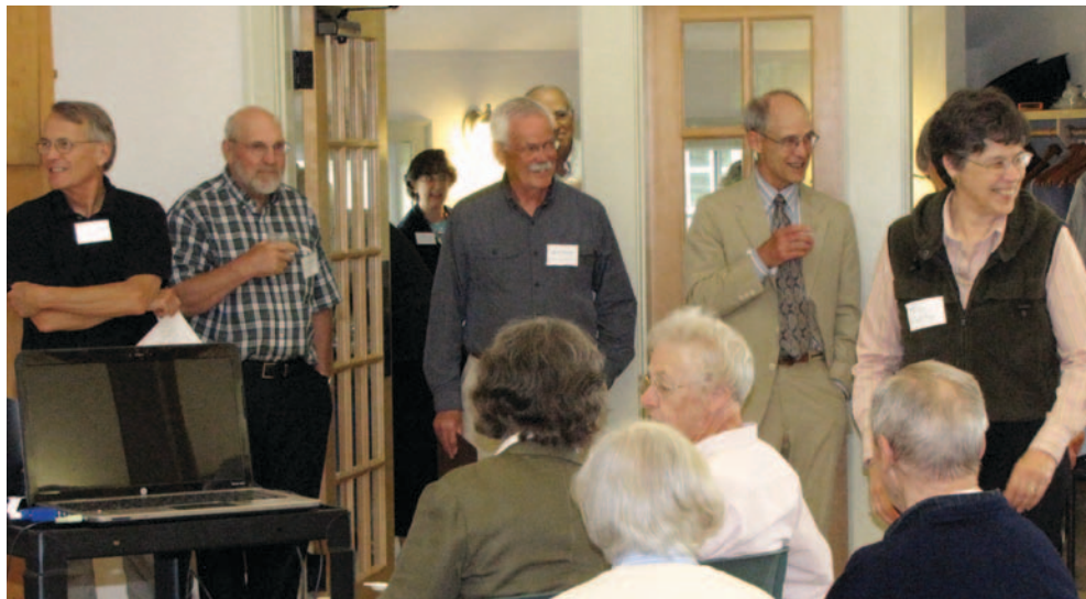
Member Gathering for the MaH Annual Meeting

with Seniors in the Eastern Monadnock Region