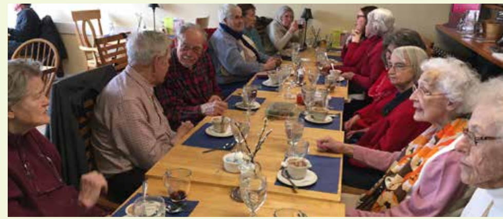
Members enjoy Valentine's luncheon at Sunflowers

maintain a zest for life. Self-care is a way of taking care of yourself. A good self-care routine involves balancing emotional, physical, and mental health! This means it's not just about physical activity and healthy food. Self-care can be creating art, having a spa day, reading a good book, meditating, or talking to a positive